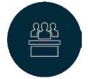
FAMILY & MATRIMONIAL LAW