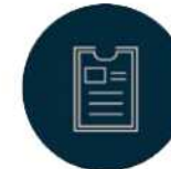
WILLS, TRUSTS, PROBATE AND ADMINISTRATION