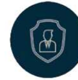
PERSONAL DATA PROTECTION