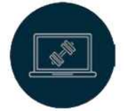
SPORTS & MEDIA